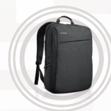
Lenovo Casual Backpack B200