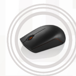
Lenovo 300 Wireless Compact Mouse