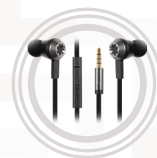
Lenovo 500 Extra Bass In-Ear Headphone