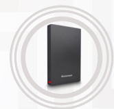
Lenovo UHD F309 1TB Portable Secure Hard Drive